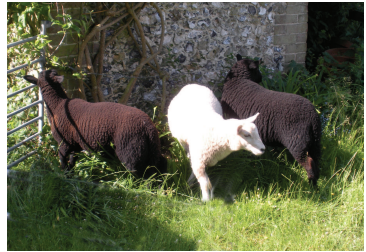
Local Welsh mountain sheep