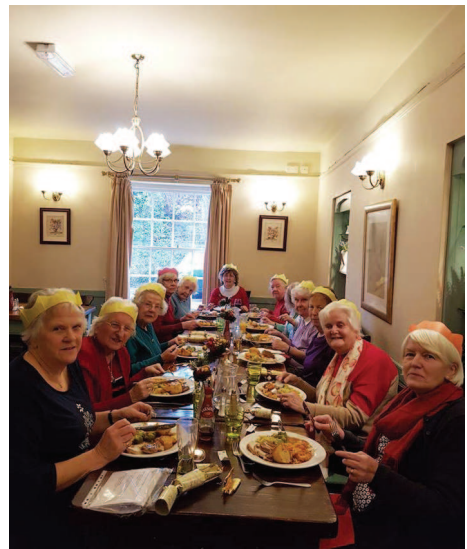
The Mothers' Union group at Castle Inn, Rowlands Castle

"Looks like they've introduced contactless payments for their collections."