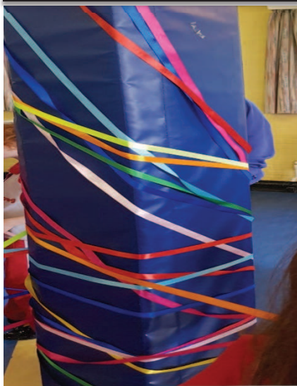
Above: The ribbon patterns on the Rainbows' Maypole.