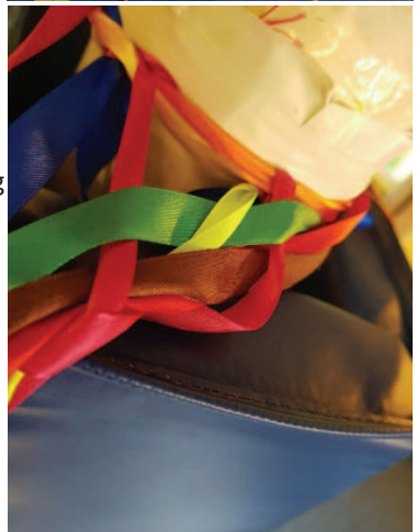
The Rainbows' Maypole and ribbon details

Bedhampton Community Website www.bedhamptonvillage.com