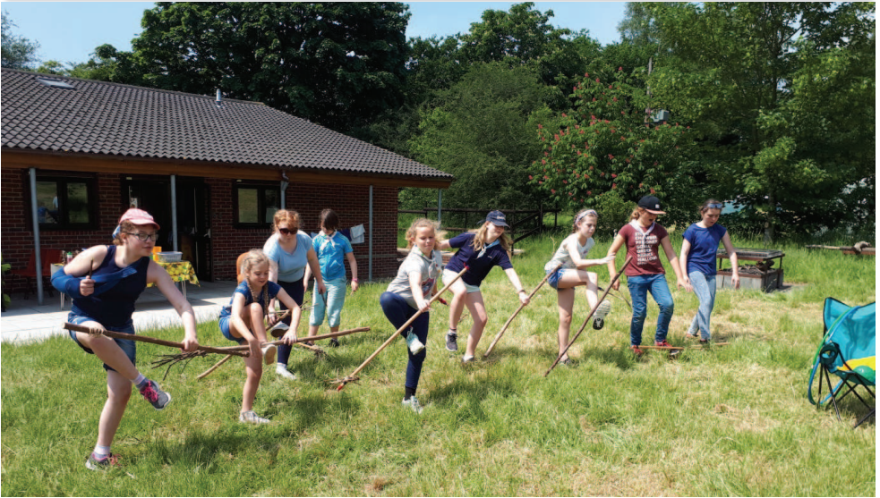
Above and left: Girlguides enjoying some Harry Potter Fun in Shedfield.