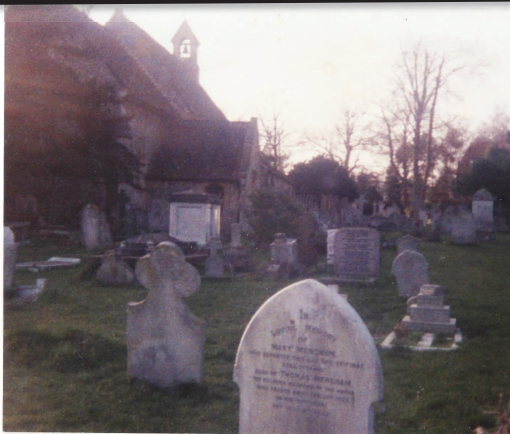
Above: St Thomas Church before work started.