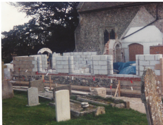
Left: Work underway.

The existing vestry was incorporated and enlarged and new stonework designed to blend in with that of the 850+ year old church.