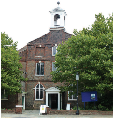
Left: St George's Right: RC Cathedral