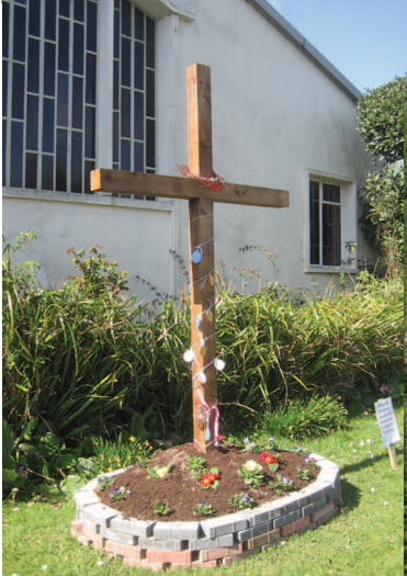
The temple, tables overturned, Matt.13:12; Judas with a bag of coins; Jesus prays at Gethsemane; (Bottom left) Easter garden at St Nicholas Church.