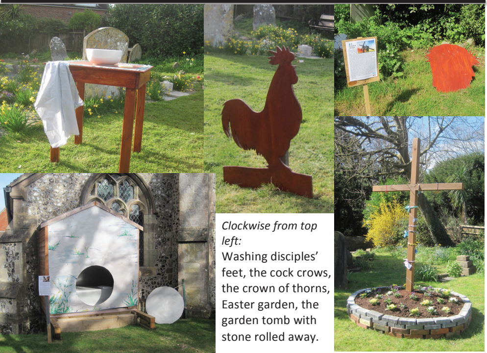
Clockwise from top left: Washing disciples' feet, the cock crows, the crown of thorns, Easter garden, the garden tomb with stone rolled away.