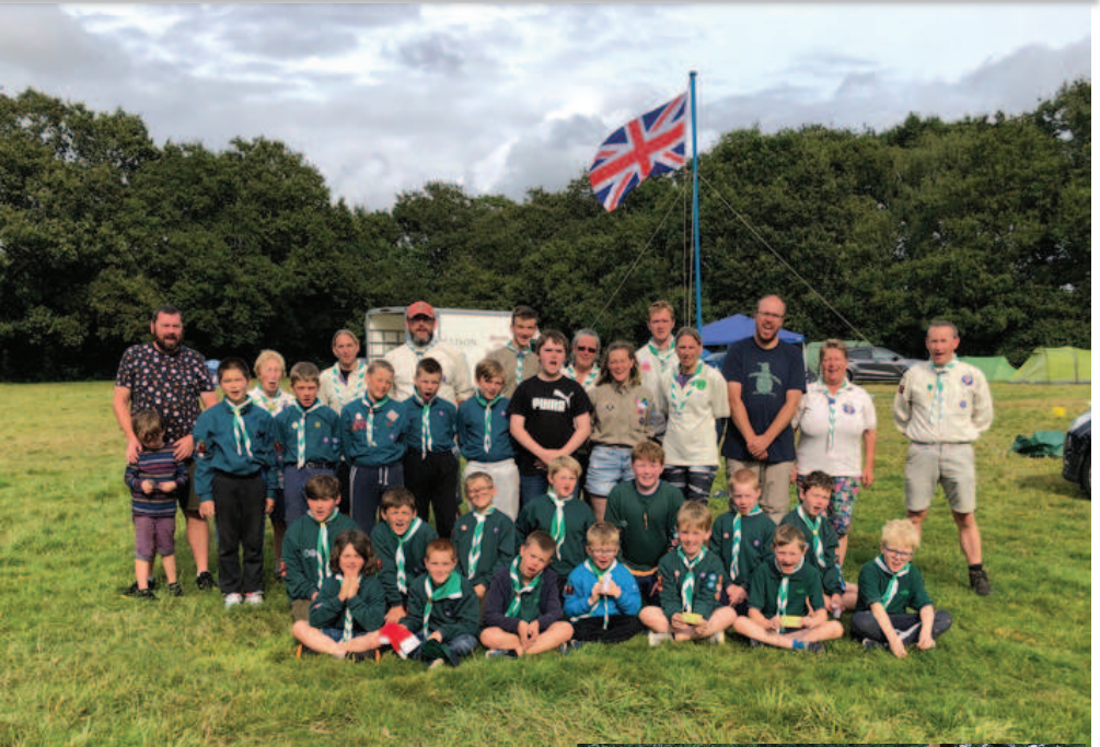
The start of Scout Camp on Sunday 15 th August Various activities were soon under way, including Christmas preparations!