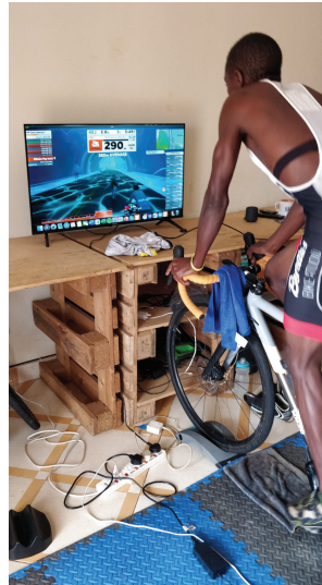
Left: Zwift set up for training.