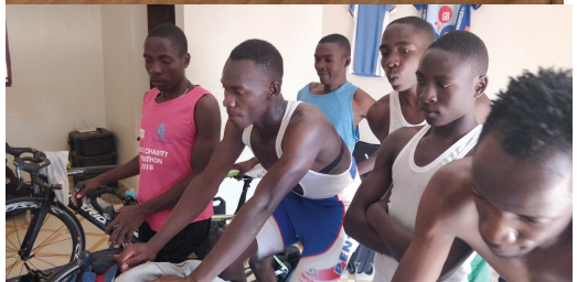
Below right: Boys encouraging each other in their training.