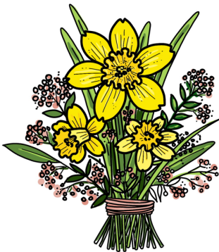
Mothering Sunday: 27 th March