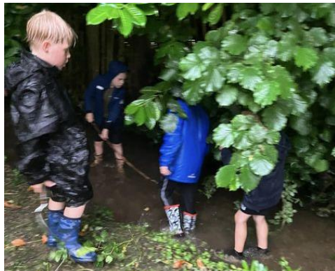
Below: a Beaver looking at a hamster

made Shelters with some very localised rainstorms and cleared the Rector's stream in a huge rainstorm. When the forecast said rain between 6.00pm and 8.00pm we didn't expect a torrential downpour of biblical proportions (but perhaps we should have). The Cubs were fascinated to see how quickly the water in the stream rose and watched from the safety of the bank till the water subsided though it was still over all their welly boots.