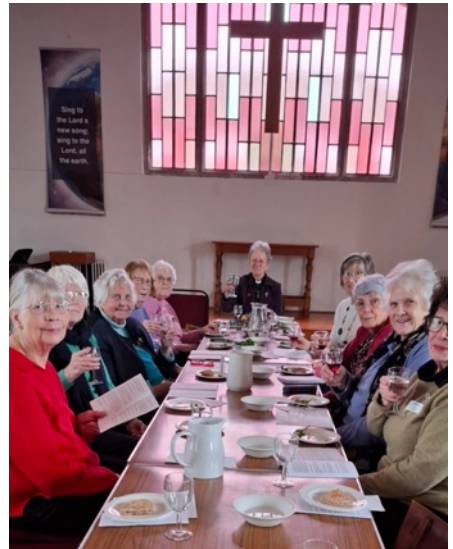
Members At The Seder Meal

The Passover meal or Seder is held to celebrate the story of Exodus when Jews were led out of Egypt by Moses leaving slavery behind them. Each part of the Seder is symbolic of the celebration of freedom from bondage : from sorrow to joy; from darkness to great light and from slavery to redemption.