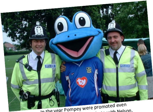
In the year Pompey were promoted even the local bobbies wanted a photo with Nelson.

Arena events have included dogs, birds, field gun crews, marching bands, dancers, reenactment groups, escapologists, circus acts and gymnastic clubs.