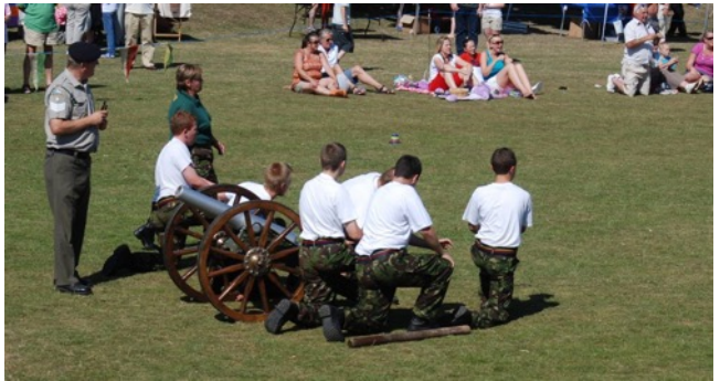
The Gun Crew in action has been one of the many arena events

The weather hasn't always been kind. Torrential rain has put dampers on things on several occasions. For those who were there in 2008, who will forget the sight of the Egyptian dancing group squelching barefoot around the arena and agility dogs slipping from the obstacle course. High winds have presented problems with gazebos flying in all directions and volunteers in pursuit. Despite these setbacks most of the memories are of glorious summer days with everyone enjoying the show.